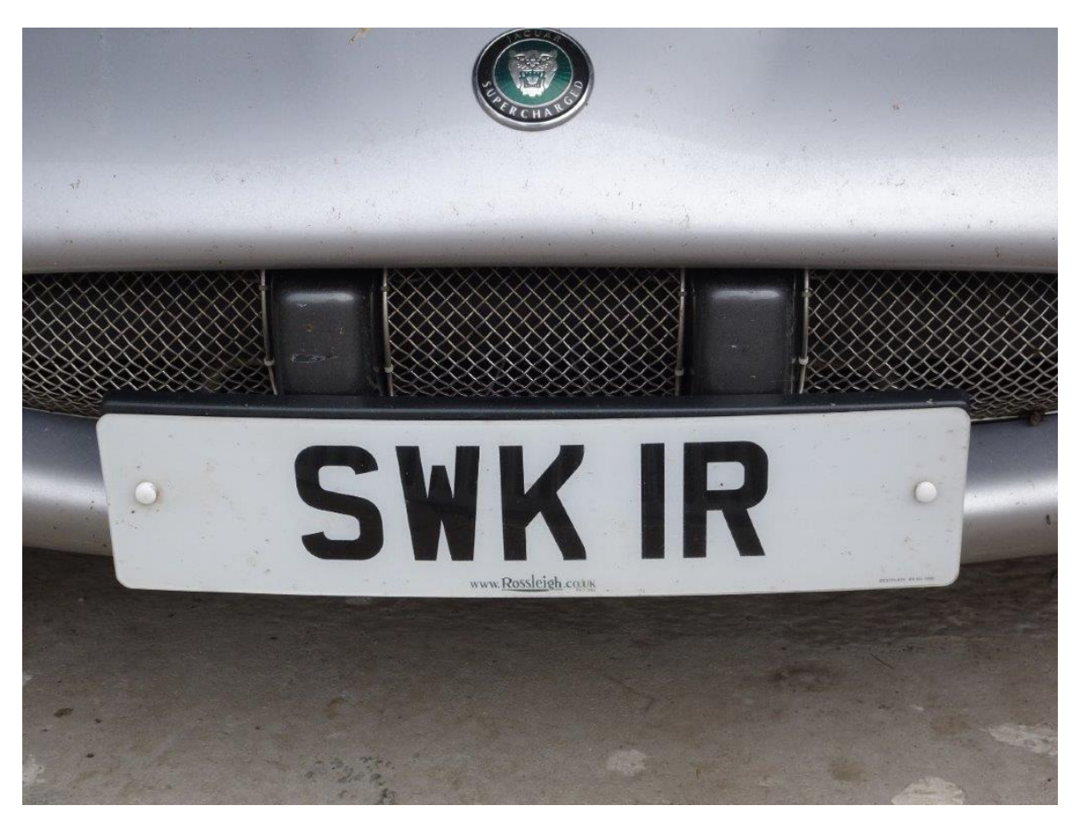
2.8 Bob's 'Jag' with the personalised number plate that set the whole fad going!